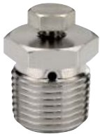
Bleed Plug, see pg. 65 for details.