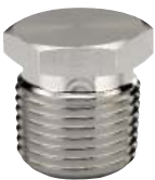
Multiport Plug, see pg. 65 for details.