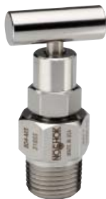
Bleed Valve See pg. 48 for details.