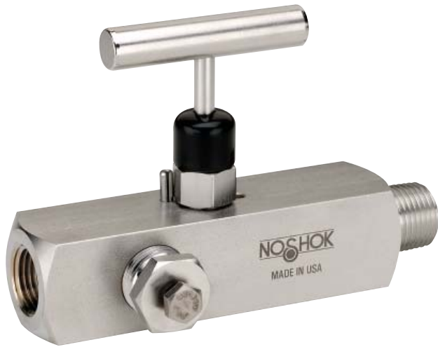
Note: Shown with optional bleed plug.